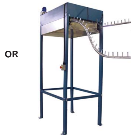
A Stand Alone frame is available