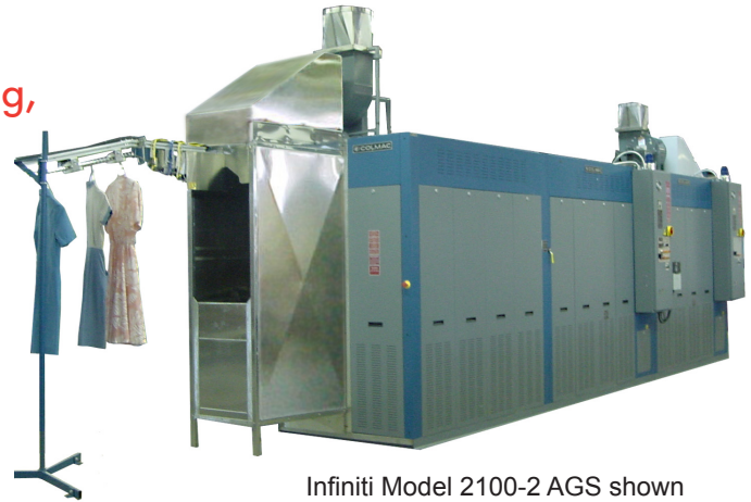
Infiniti Model 2100-2 AGS shown

The Colmac automatic two-step finishing cycle combines steam injection with the highest volume, fastest moving air delivery system available for superior de-wrinkling results on today's garments and fabric items.